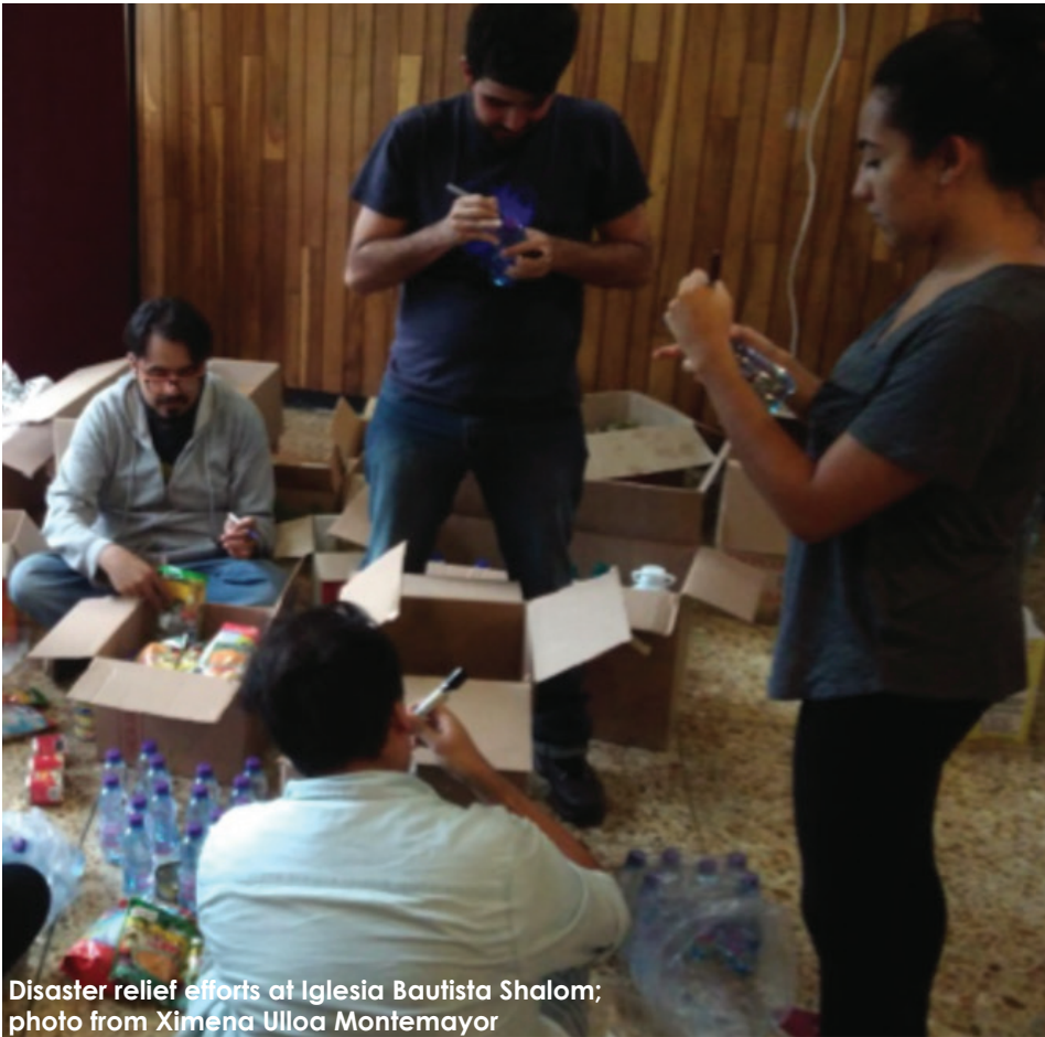
Disaster relief efforts at Iglesia Bautista Shalom

We worked with our partner organizations in Houston, Texas; Mexico and Puerto Rico to communicate immediate needs to our entire membership. For Mexico and Puerto Rico we also raised funds for grassroots on the ground efforts responding to the devastating conditions created in many communities.