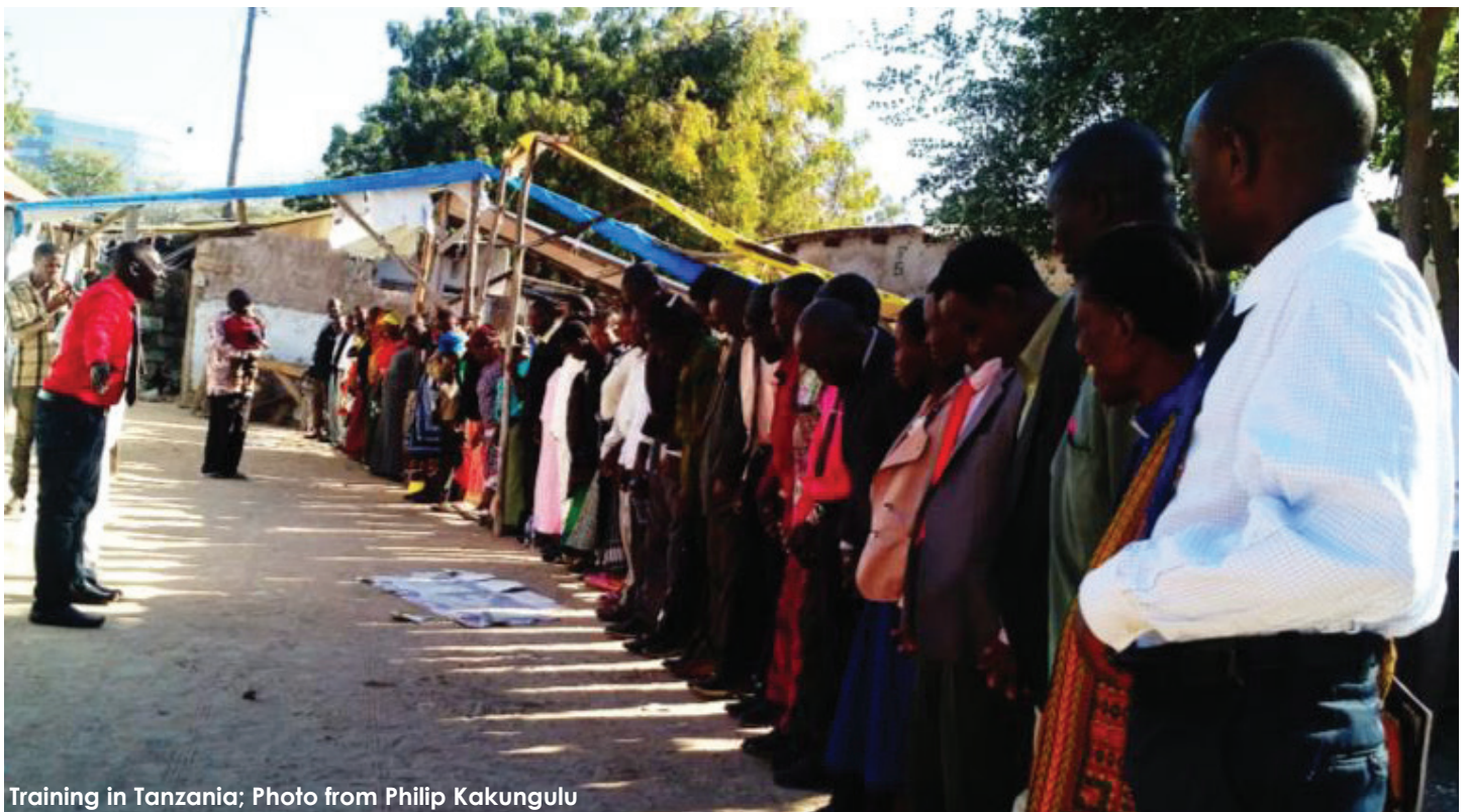
Training in Tanzania; Photo from Philip Kakungulu