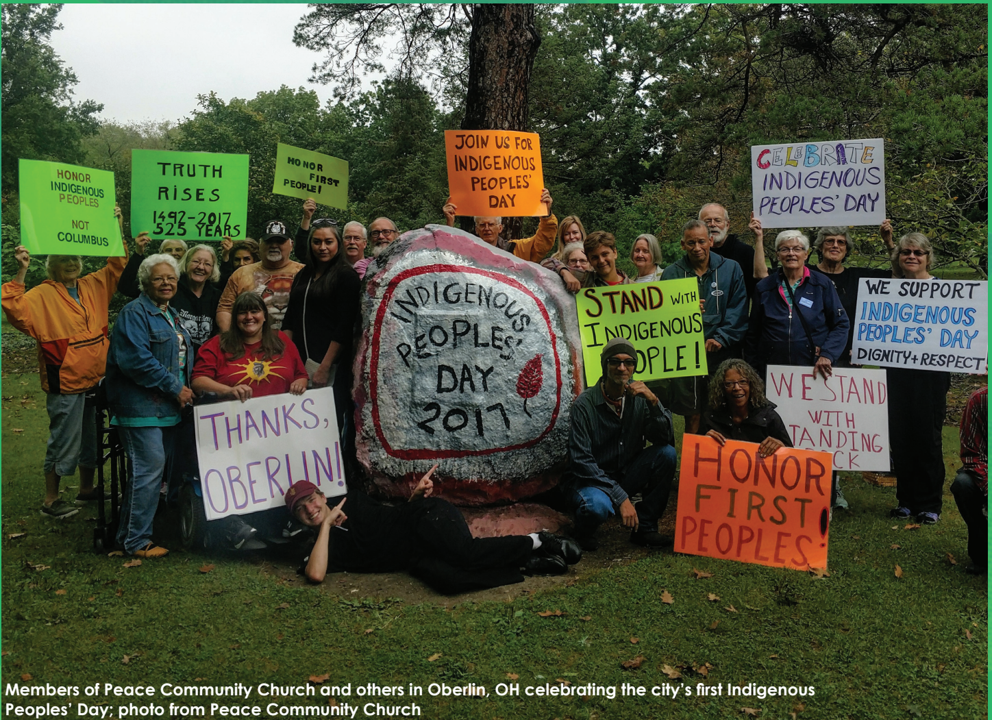
Members of Peace Community Church and others in Oberlin, OH celebrating the city's first Indigenous Peoples' Day