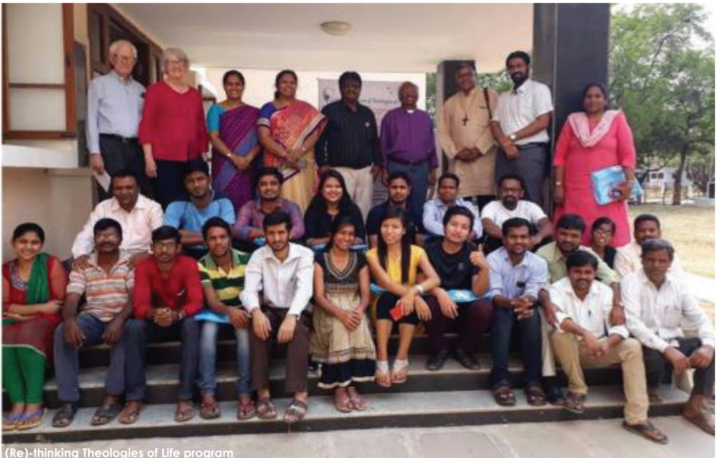
(Re)-thinking Theologies of Life program

The Global Baptist Peace Conference in Cali, Colombia. The conference is a continuation of a series of global peace conferences that began in 1988 in Sweden. The BPFNA has been a sponsor of all of them (Nicaragua, Thailand, Australia, Italy). This conference will be similar to the Rome conference providing 8-10 training seminars, 48 workshops, and a week-long gathering of Baptists and others from around the world. The purpose is for networking, training, education, spiritual support and renewal, and for enhancing the development of peacebuilding around the globe, particularly through regional groups.