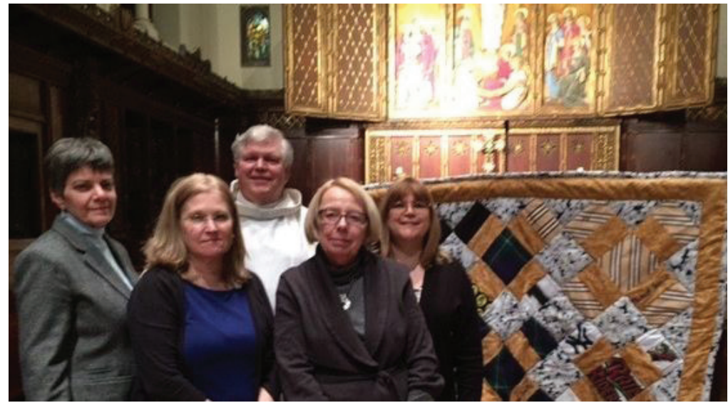
Members of BPFNA Partner Congregations in Rhode Island display a quilt made in remembrance of victims of gun violence. Members of the Rhode Island Religious Coalition can have this quilt on display during services of prayer and concern for gun violence.

BPFNA staff also brought greetings, spoke, visited, or preached at 22 Partner Congregations throughout 2015.