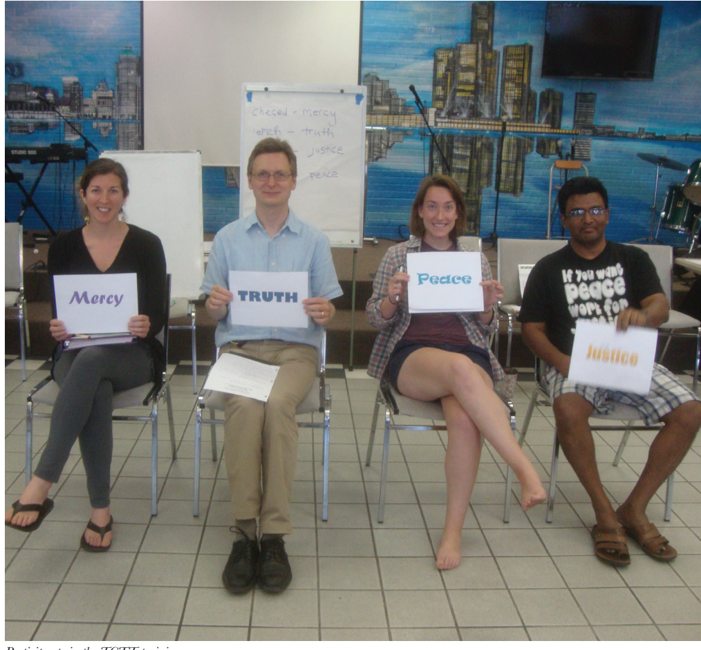
Participants in the TCTT training.

BPFNA staff members attended two-day Dismantling Racism workshops to strengthen our ability to do anti-oppression work.