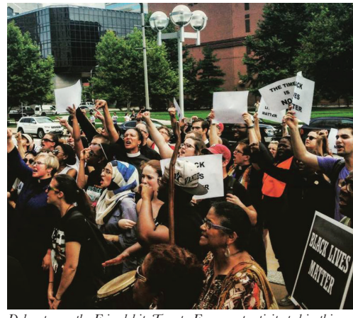
Delegates on the Friendship Tour to Ferguson participated in this Moral Monday action in front of the St. Louis Department of Justice to demand more accountability from police and state officials.