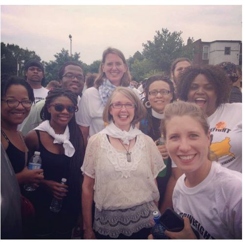
Members of the BPFNA Friendship Tour to Ferguson/St. Louis.

While there, we provided our members and churches with frequent updates from Ferguson along with an extensive list of ways individuals and churches outside of Ferguson could participate and support the commemoration events.