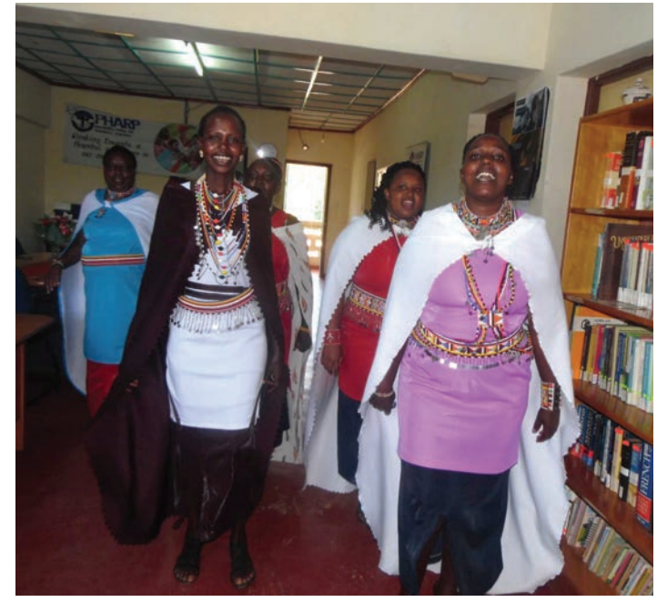
ipants in the Bugenyuzi commune, Province of Karuzi in early March, 2020. (See the photos on page 14.)

foster peaceful cohesion and political tolerance. With his Peace Fund ~ Fondos por la Paz grant, he carried out a two-day workshop for 30 partic-