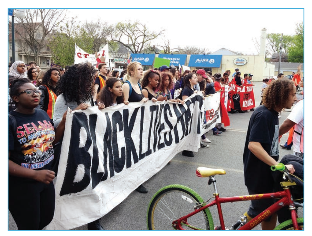
Left: A Black Lives Matter action in Minneapolis, MN.

in ballots, and the construction of a narrative of a fraudulent electoral process, BPFNA curated and offered peacemakers reliable information, materials and practical tools to help them face the unrest. The workshop "Dialogues in Democracy" was developed as a breathing space to share concerns, center expectations and point to actions in preparation for unrest. For more, see our post, "Counting Every Vote as a Matter of Justice" at www.bpfna.org/news.