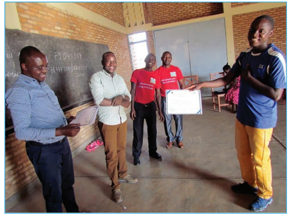
Left, top and bottom: Young people participate in a 30-day training facilitated by by the Pan-African Peace Network in Burundi.